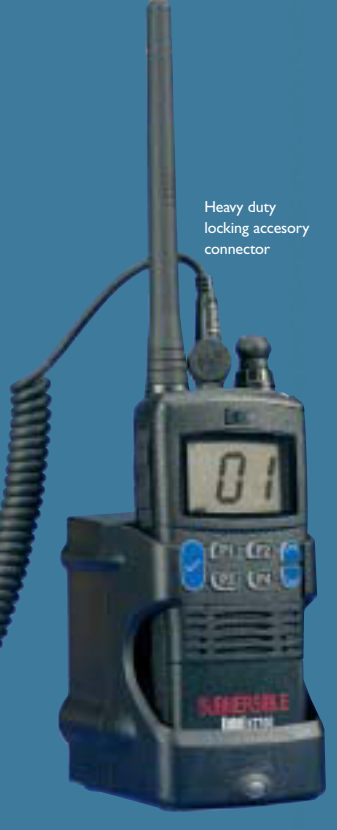
CSA640E optional rapid charger

Dependable - The HT700 series utilises state of the art technology with leading edge features, ensuring that it can be depended upon in the most extreme conditions.